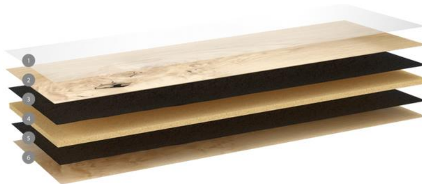
Figure 1. Layers of Woodura® floorboard

The Woodura® wooden floor is build up by six layers: (1) hardwax or UV lacquer; (2) oak or ash wood covering; (3) wood-based powder layer; (4) high quality moisture-resistant high-density fibreboard (HDF); (5) wood-based powder layer; and (6) wood veneer layer (Figure 1).